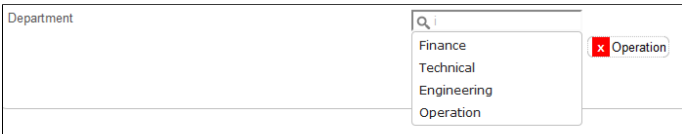
Figure 2: Selecting an Item in a Multi Select Box