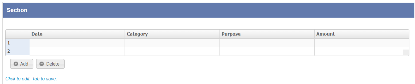
Figure 1: Advanced Grid form element