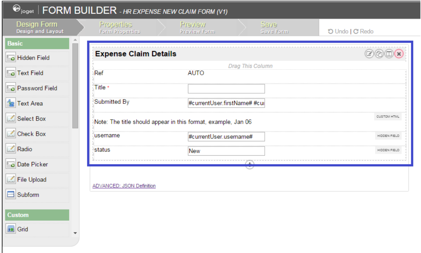
Figure 1: Section highlighted in blue in sample HR Expenses Claim app

Section is the placeholder to hold Form Elements. Each section has one column in it by default.