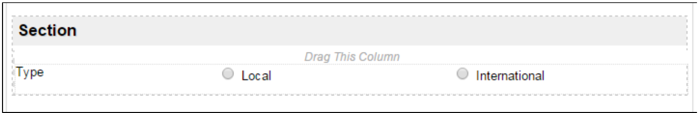
Figure 1: Sample Radio in Form Builder

Radio is one of the generic HTML Form input elements. In the Form Builder, one is able to define the options available to the Select Box via various means, including with the use of Options Binder.