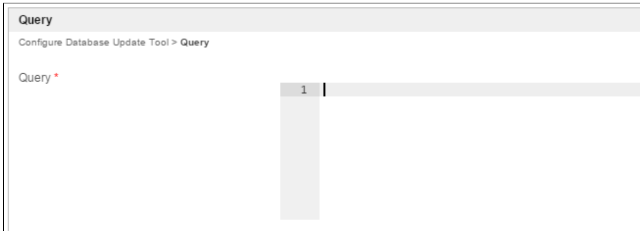
Figure 2: Database Update Tool Properties - Query