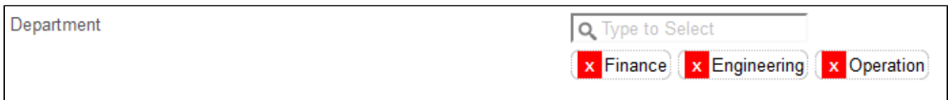
Figure 3: Selected Items in a Multi Select Box