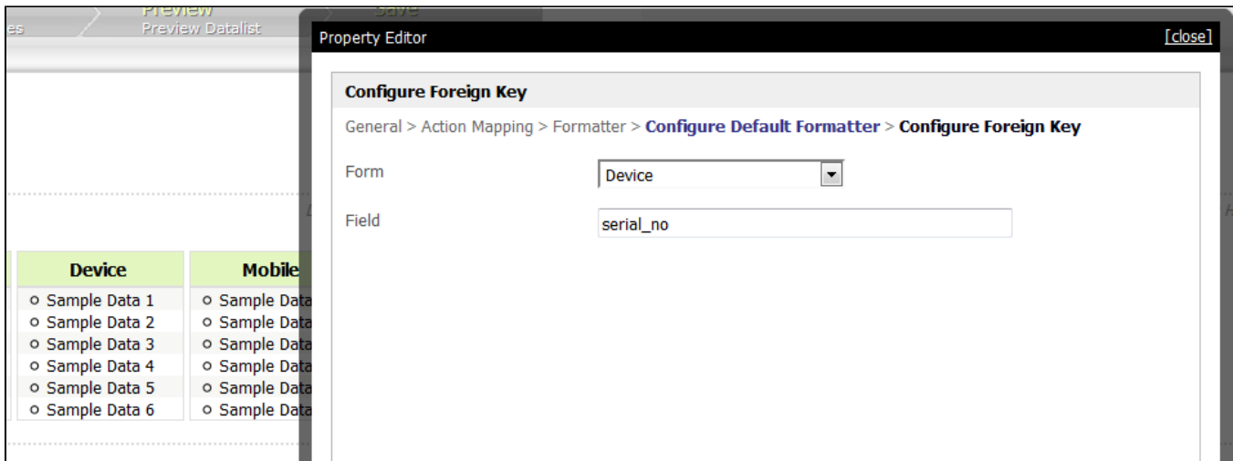
Figure 2: Default Formatter Properties - Configure Foreign Key

It is also possible to map the value as a foreign key to another form table to display certain column value. Please see Formatting and Making Foreign Key Reference Using Default Formatter for example.