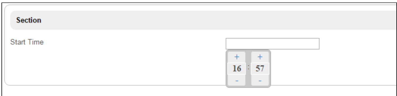
Figure 2: Time Picker in actual form