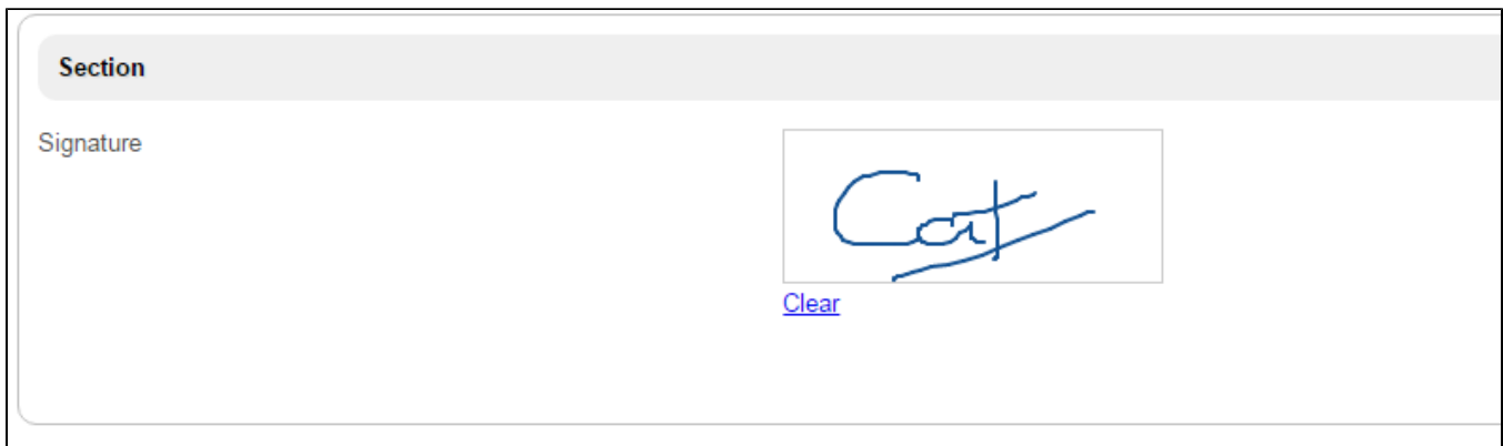
Figure 2: Signature in actual form