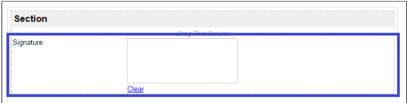
Figure 1: Screenshot highlighting Signature in Form Builder

Signature is a special element with canvas to collect user's input by scribbling/sketching on it.