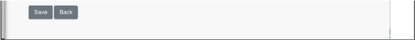
Figure 1: Width of more than 900px (top), and less than 900px (bottom)

Add this CSS code into a Custom HTML element.