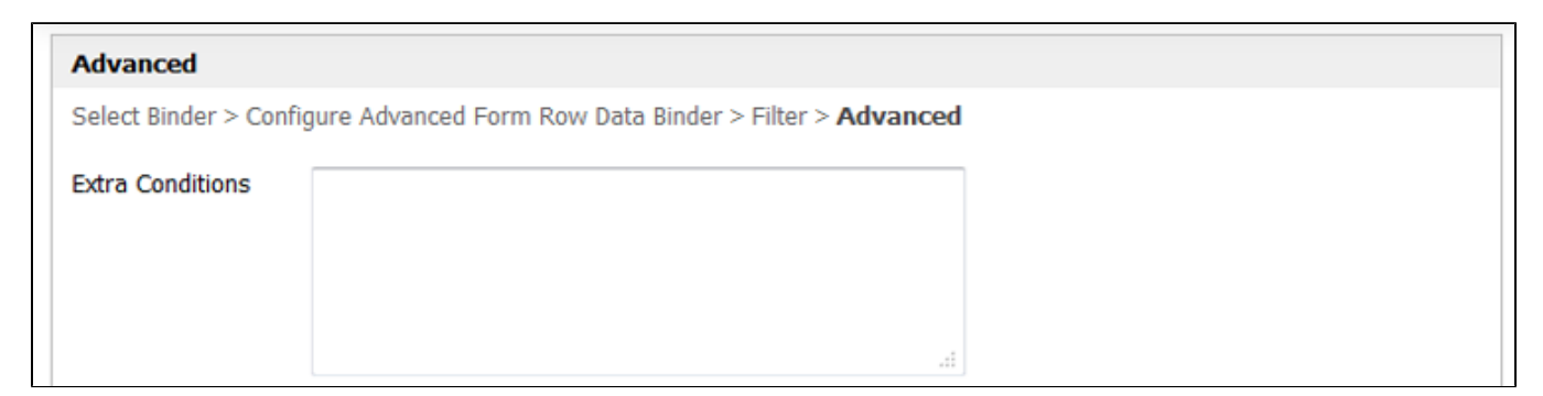
Figure 2: Advanced properties in Advanced Form Row Data Binder

One may also specify Extra Conditions for filters that are not available in the Filter Conditions on the previous tab. For example,