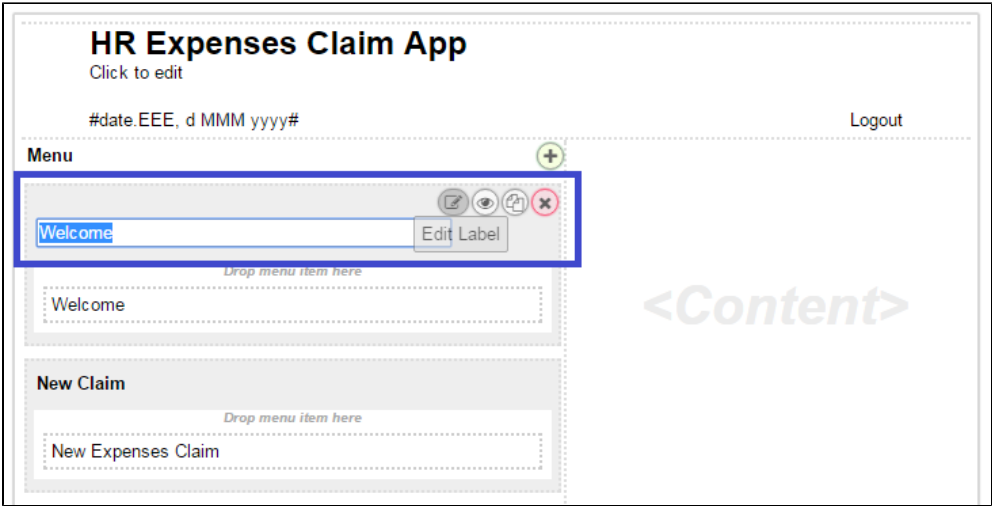
Figure 2: Screenshot highlighting individual category in editing mode