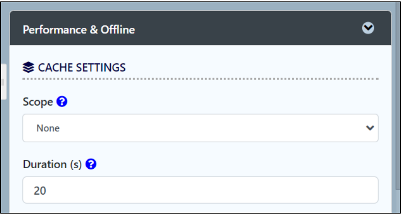
Figure 3: Cache Settings