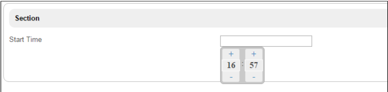
Figure 2: Time Picker in actual form