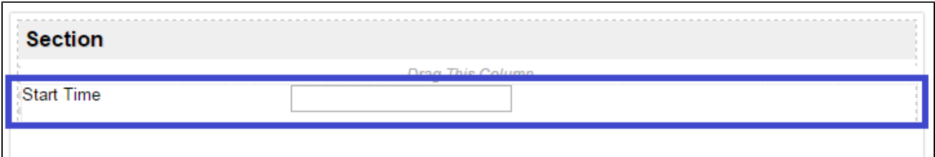
Figure 1: Time Picker in Form Builder