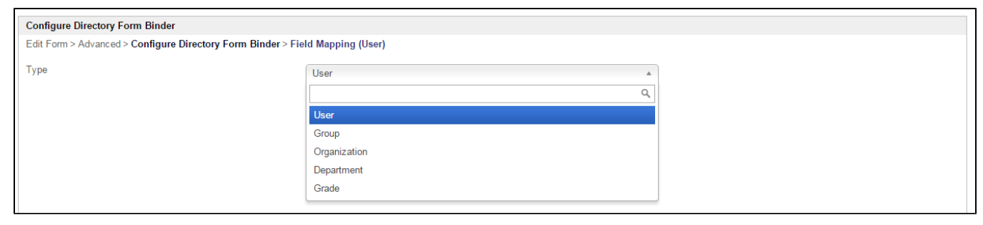
Figure 1: Directory Form Binder Properties