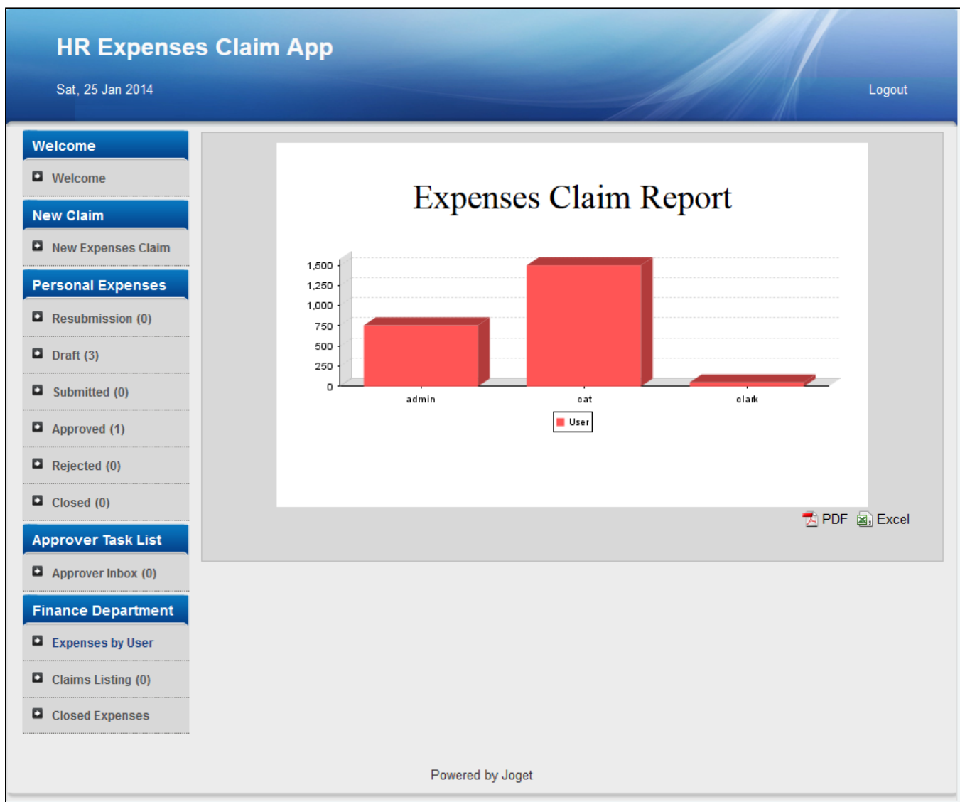
Figure 3: Running your Report in the actual Userview