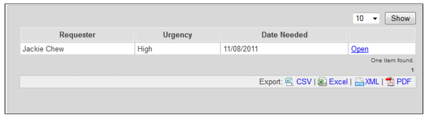
Figure 1: Datalist Inbox Userview Menu (Inbox with Form Data)

Datalist Inbox Userview Menu extends the usability of Datalist Builder's listing with the generic Task Inbox. Unlike the usual Task Inbox which has it's own set of predefined columns, Datalist Inbox Userview Menu enables you to select your own list, allowing you to display the key value of an item. This increases productivity and cuts down time wasted clicking and checking each item.